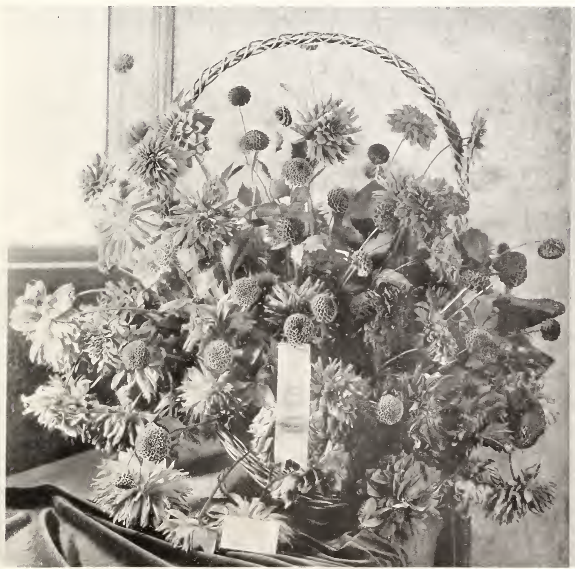
The above cut is one of our first prize baskets, which won cash prize of $50.00. It shows the beauty of the Dahlia as a flower for baskets and vases. Note the arrangement including Peony, Cactus, Decorative and Pompon Dahlias.